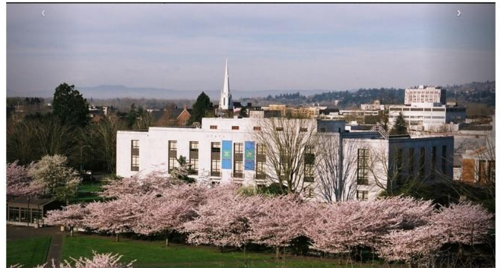
State Library of Oregon

Located on the Capitol Mall State Park in Salem, OR