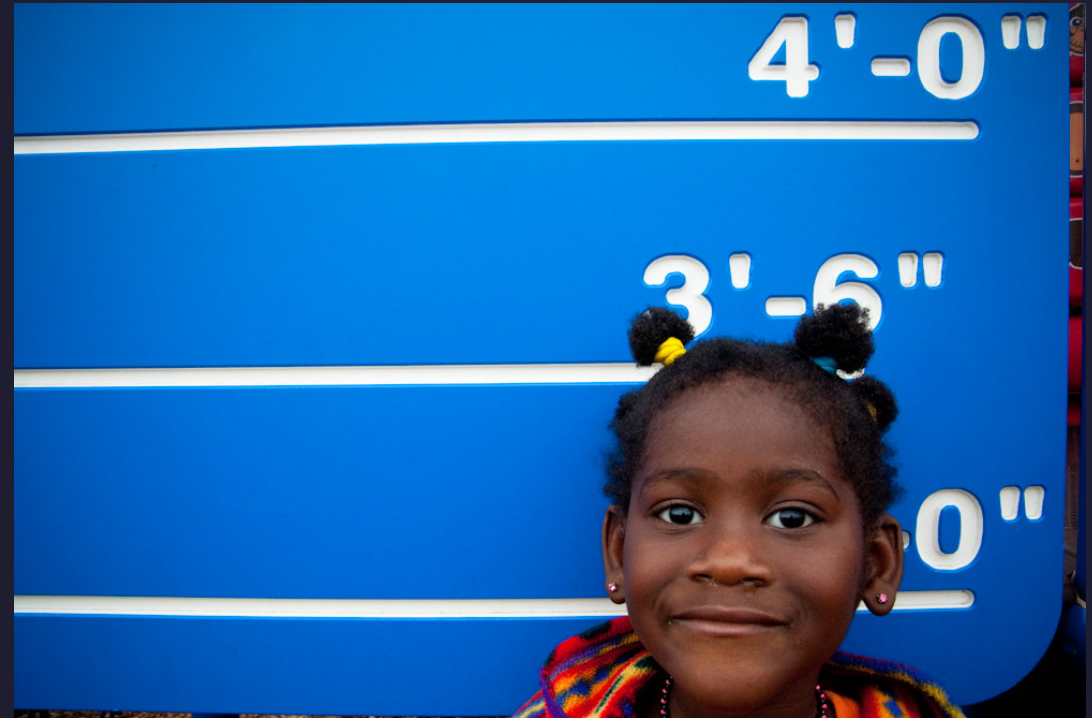
Depolo, Steven. "Little Black Girl Measure Height 3' 6" Ruler Manhattan Park Playground." Flickr, October 23, 2010. Accessed April 5, 2018.