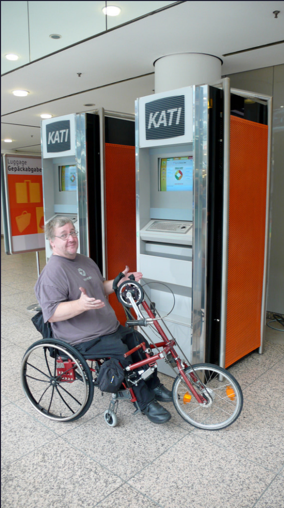
PaxeAxe23. "Disabled access?" Flickr, October 21, 2006. Accessed April 5, 2018.