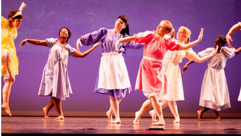
The Sacred Harp by Freneticore Dance