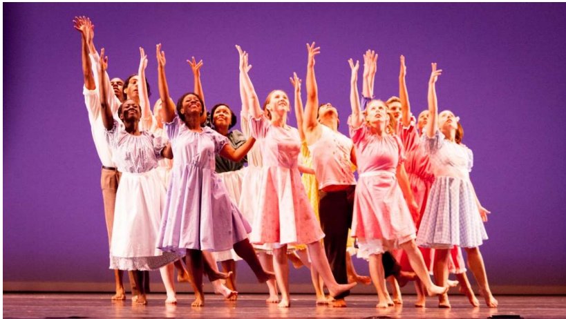
The Sacred Harp by Freneticore Dance