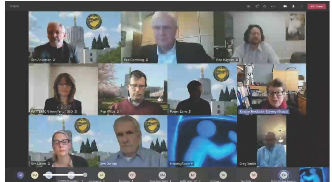
Joint Committee On Ways and Means Subcommittee On General Government 02/10/2021 1:00 PM