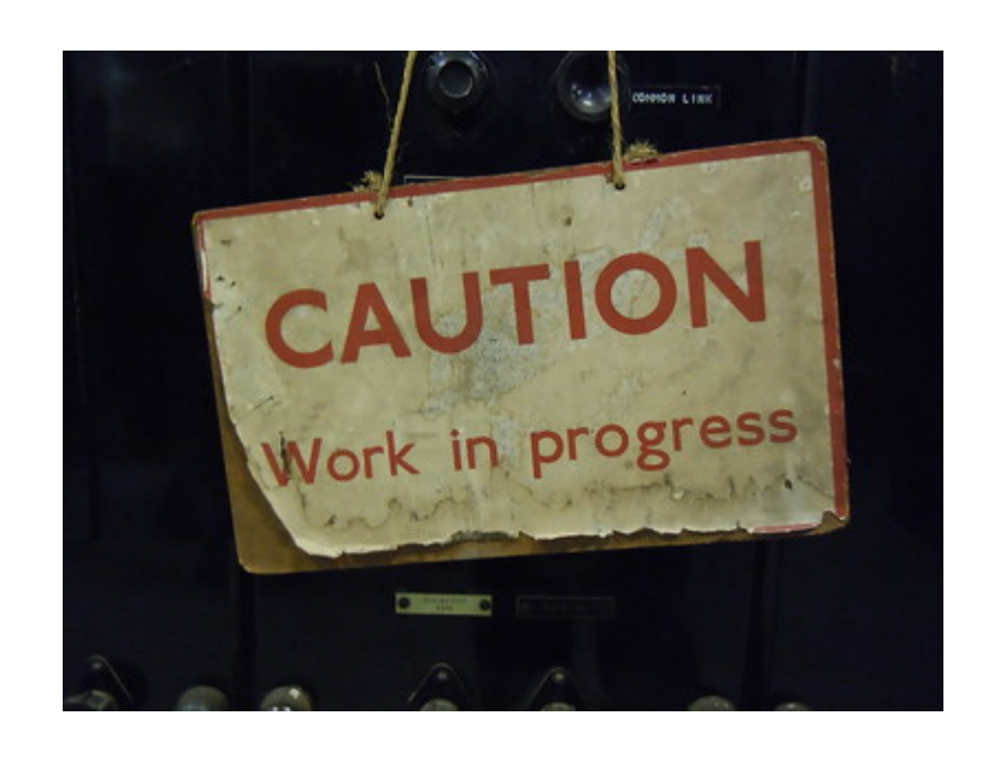
"Work in Progress" by Kevan (Flickr, CC BY 2.0)