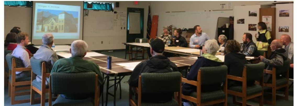
Stakeholders at the design workshop